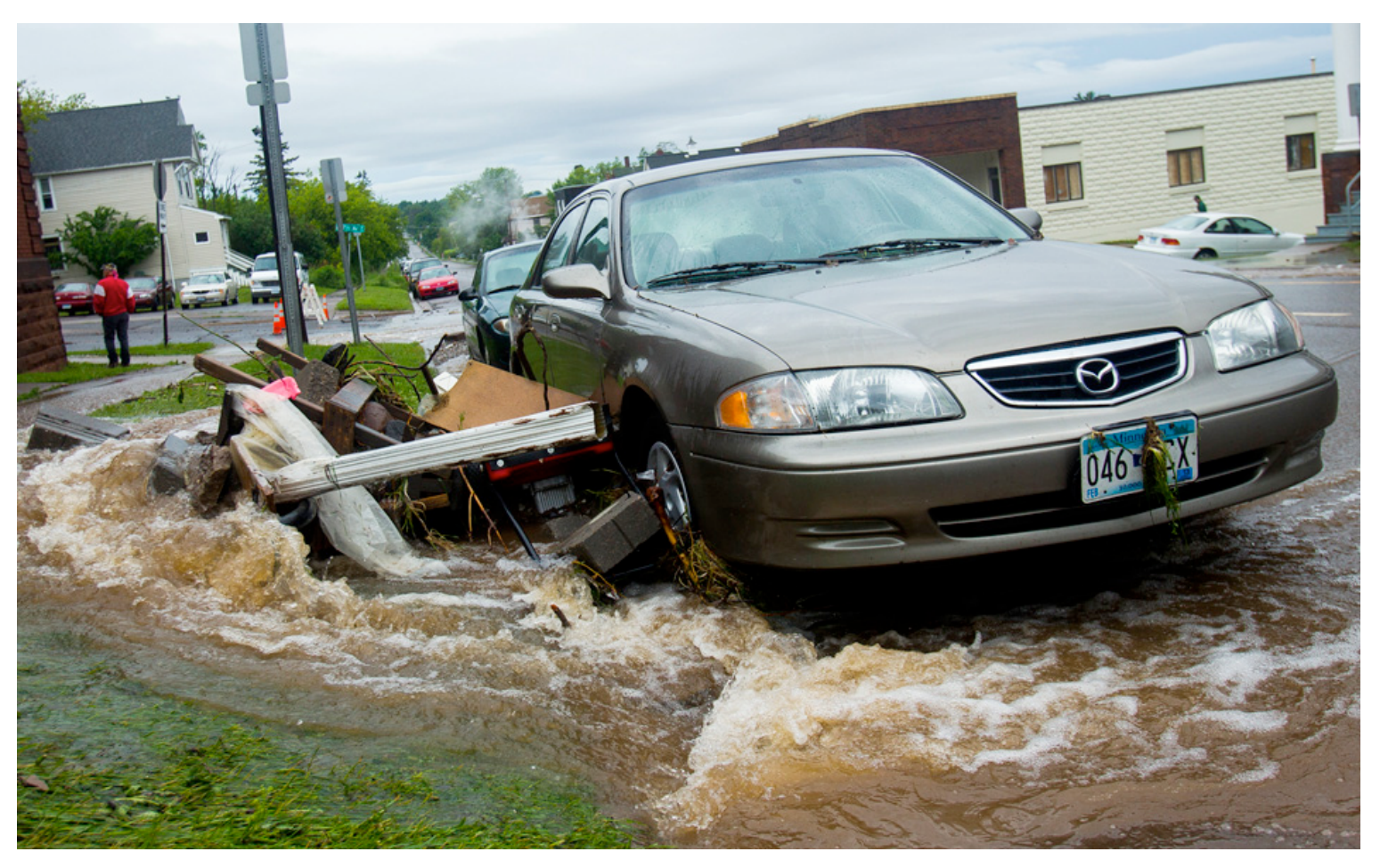
Duluth, Minn. — Water from an overflowing Brewery Creek in downtown Duluth, Minn. washed trash and other debris against a parked vehicle Wednesday morning after heavy rains caused flooding in Duluth, Minn. (Read more about the flood) LINK TO THIS PHOTO