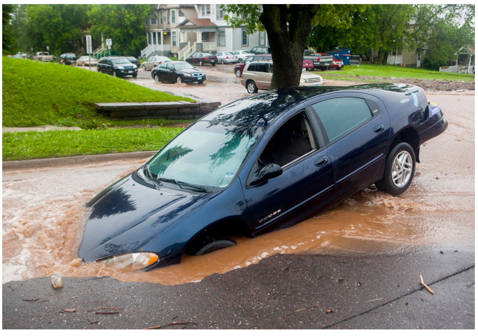
Duluth, Minn. — A sinkhole got the better of this car at the corner of First Street and Seventh Avenue East Wednesday morning after heavy rains caused flooding in Duluth, Minn. (Read more about the flood) LINK TO THIS PHOTO