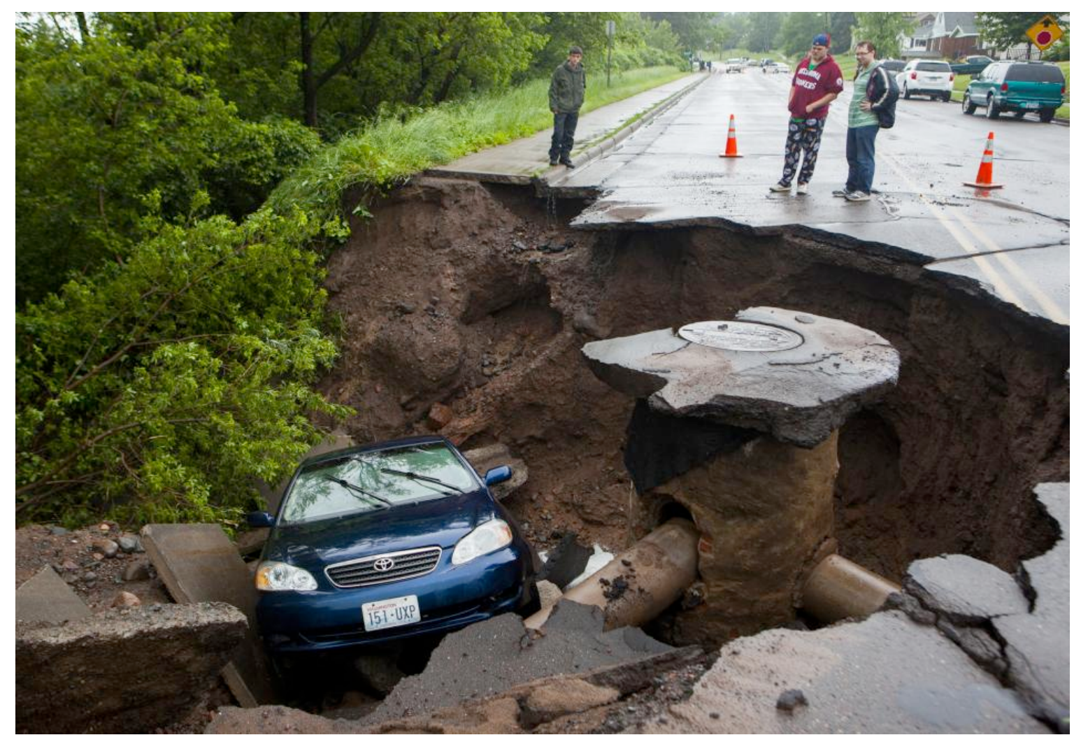
Duluth, Minn. — A giant sinkhole along Skyline Parkway near Ninth Avenue East captured this car Wednesday morning after heavy rains caused flooding in Duluth, Minn. (Read more about the flood) LINK TO THIS PHOTO

Major flooding in northeastern Minnesota has closed roads, Duluth City Hall and the University of Minnesota campus, and has authorities recommending emergency travel only.