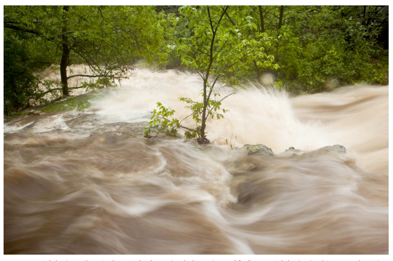
Duluth, Minn. — Chester Creek rages Wednesday morning after heavy rains caused flooding across Duluth, Minn. (Read more about the flood) LINK TO THIS PHOTO