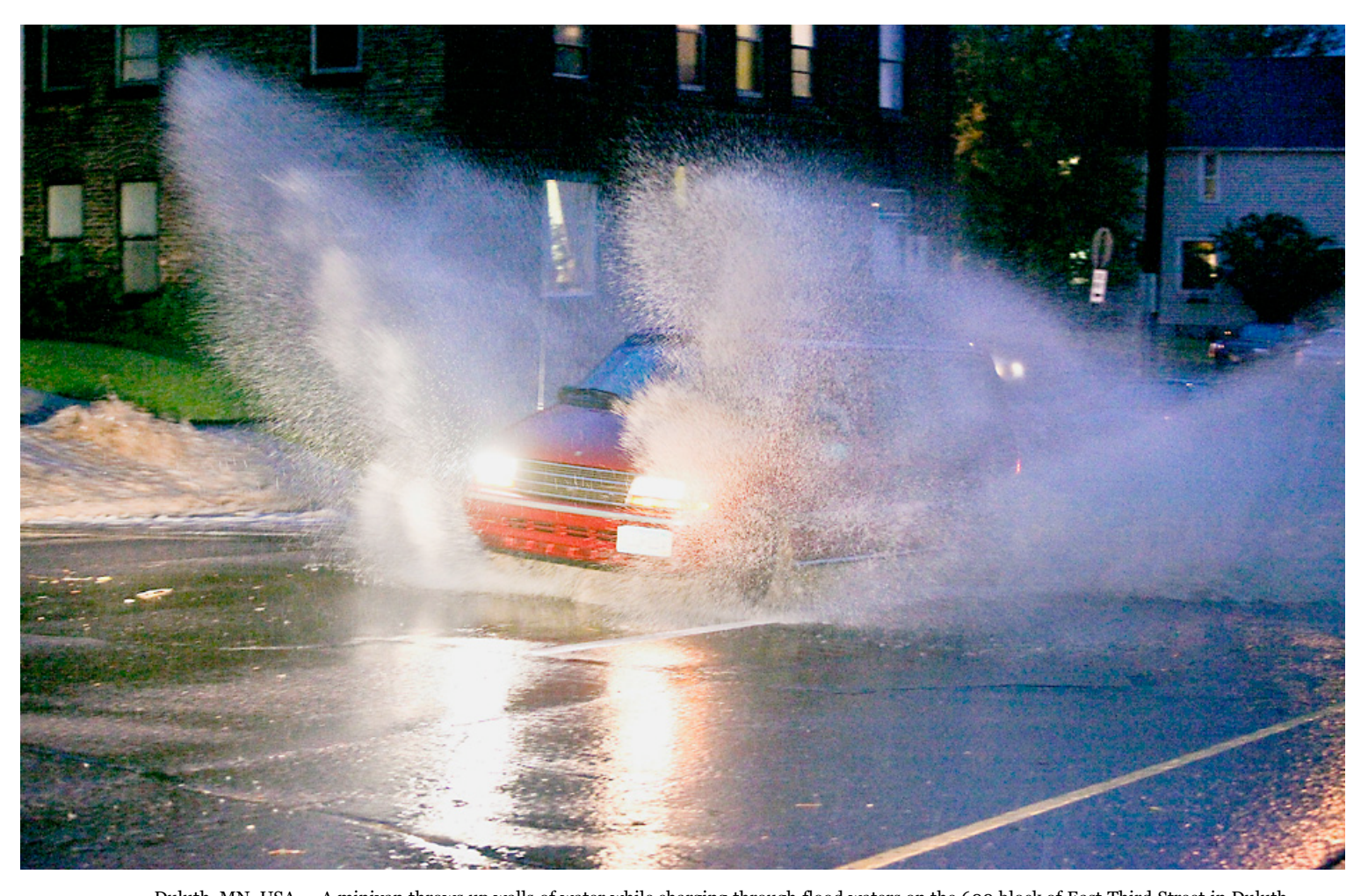
Duluth, MN, USA — A minivan throws up walls of water while charging through flood waters on the 600 block of East Third Street in Duluth, Minn., Tuesday, June 19, 2012, after heavy rains hit the area. (Read more about the flood) LINK TO THIS PHOTO