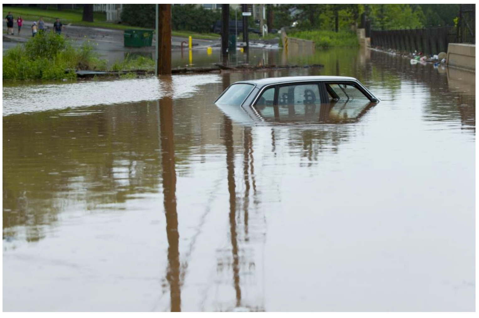
Duluth, Minn. — A car sits submerged in flood waters between First Street and the Interstate 35 tunnels Wednesday morning after heavy rains caused flooding in Duluth, Minn. (Read more about the flood) LINK TO THIS PHOTO