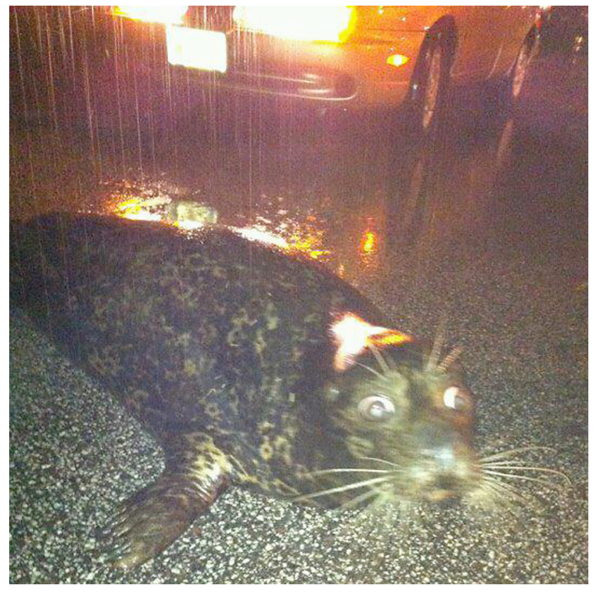
DULUTH, Minn — This seal is one of two that escaped from the Lake Superior Zoo in Duluth during last night's floods. It was photographed on Grand Avenue. Zoo officials say the seals were returned safely. (Read more about the flood) LINK TO THIS PHOTO