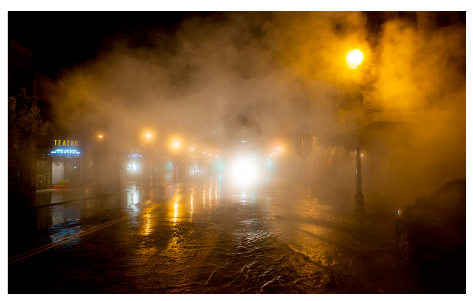
Duluth, Minn. — Steam rises into the sky while heavy rains pummel downtown Duluth, Minn. early Wednesday morning. (Read more about the flood) LINK TO THIS PHOTO