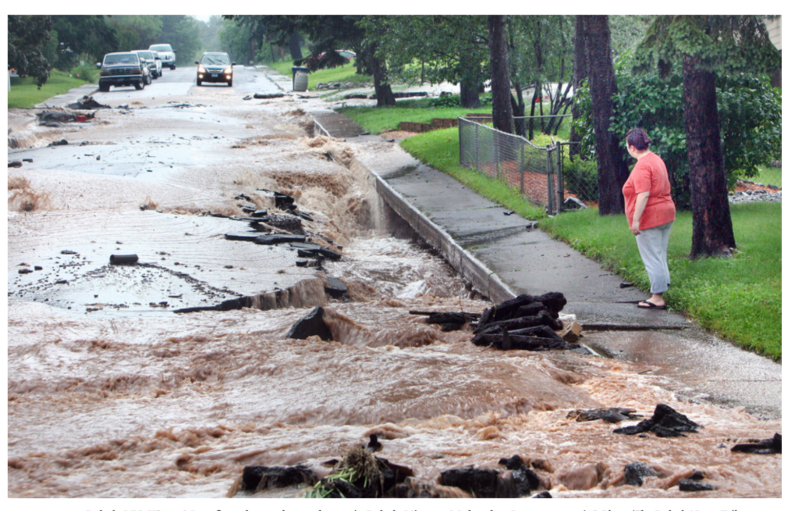
Duluth, MN, USA — Water flows down a damaged street in Duluth, Minn. on Wednesday, June 20, 2012. (Read more about the flood) LINK TO THIS PHOTO