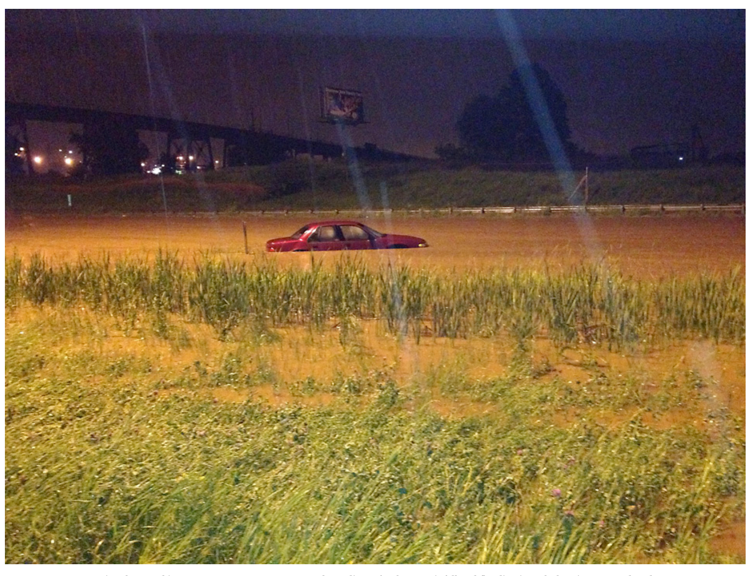
A car is submerged in water on Interstate 35 near Wade Stadium after heavy rainfall and flooding in Duluth, Minn. on Wednesday, June 20, 2012. (Read more about the flood) LINK TO THIS PHOTO