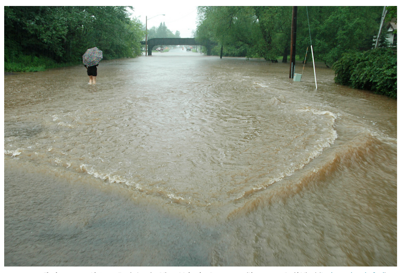
Flood waters cover 6th Avenue East in Superior, Wis. on Wednesday, June 20, 2012. (Read more about the flood) LINK TO THIS PHOTO