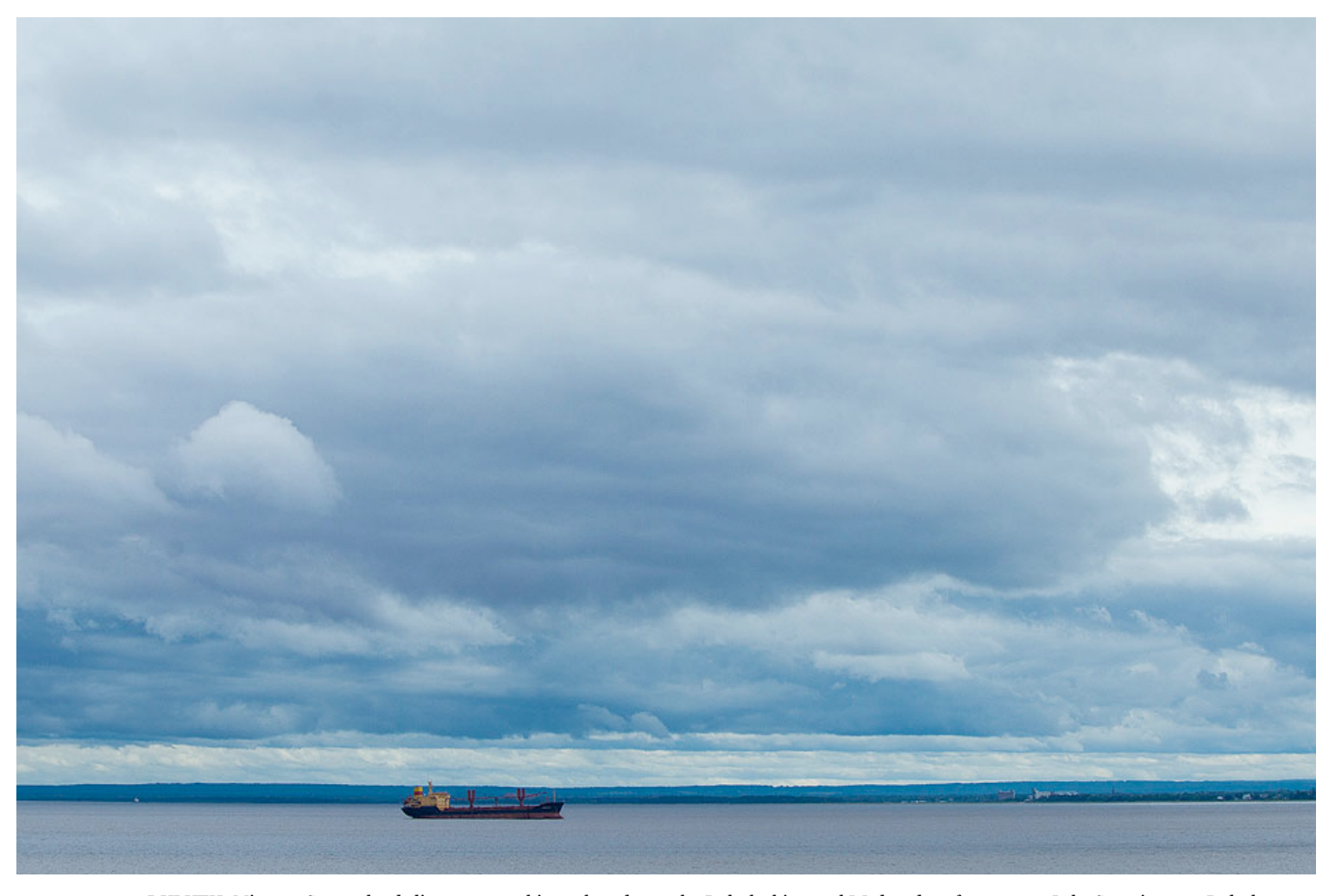
DULUTH, Minn. — Storm clouds linger over a ship anchored near the Duluth ship canal Wednesday afternoon on Lake Superior near Duluth, Minn. LINK TO THIS PHOTO