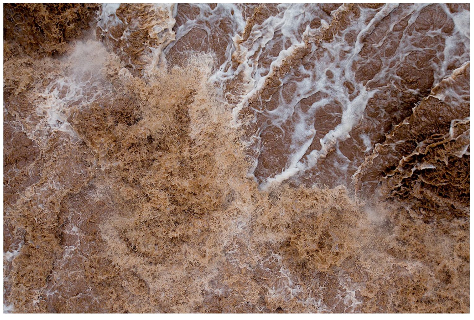
Lester River rages under the Superior Street bridge Wednesday afternoon in Duluth, Minn. LINK TO THIS PHOTO