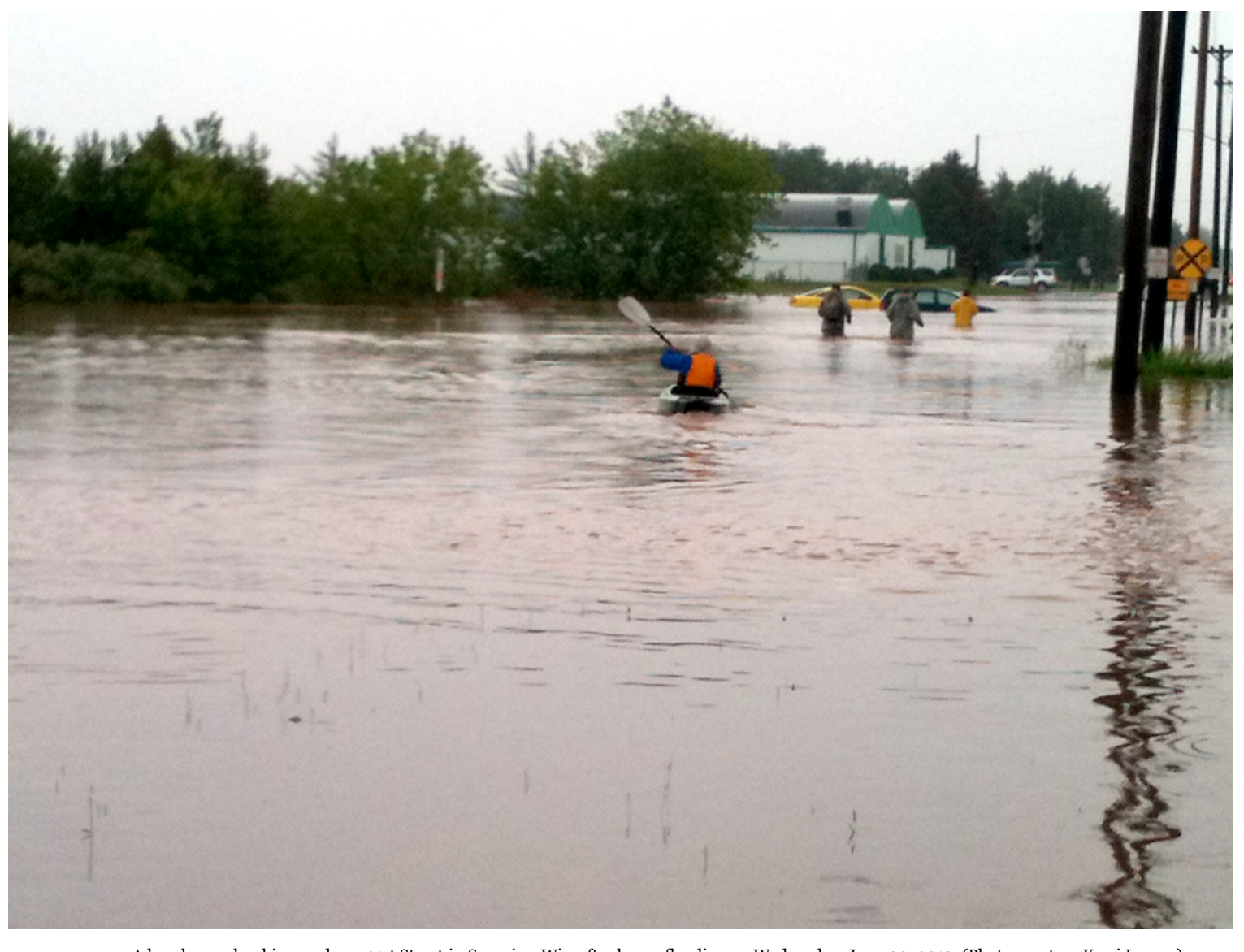
A kayaker makes his way down 21st Street in Superior, Wis. after heavy flooding on Wednesday, June 20, 2012. (Read more about the flood) LINK TO THIS PHOTO