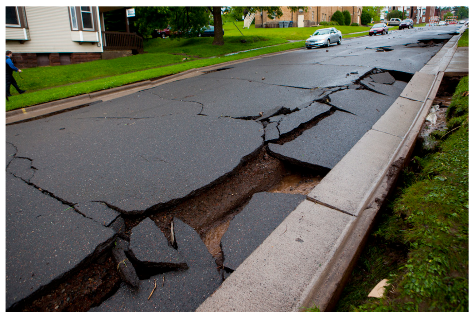
Duluth, Minn. — Portions of Seventh Avenue East in Duluth, Minn. collapsed Wednesday morning after heavy rains caused flooding. (Read more about the flood) LINK TO THIS PHOTO