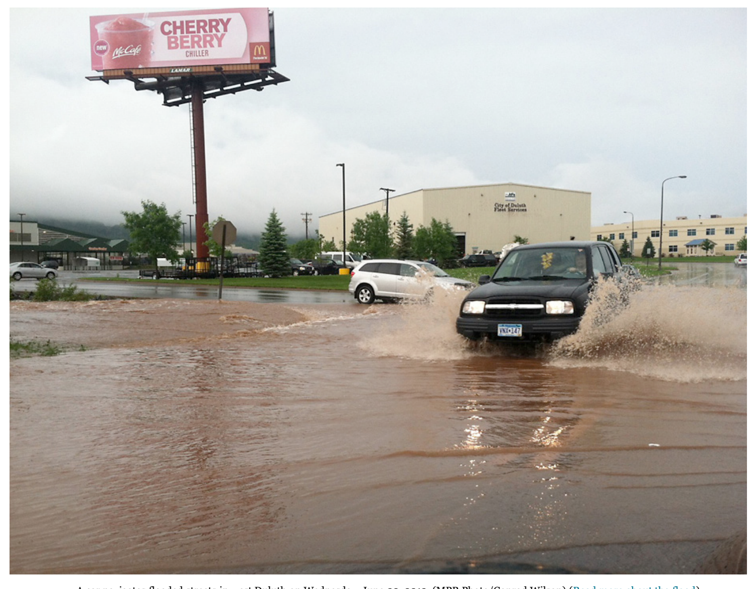
A car navigates flooded streets in west Duluth on Wednesday, June 20, 2012. (Read more about the flood) LINK TO THIS PHOTO