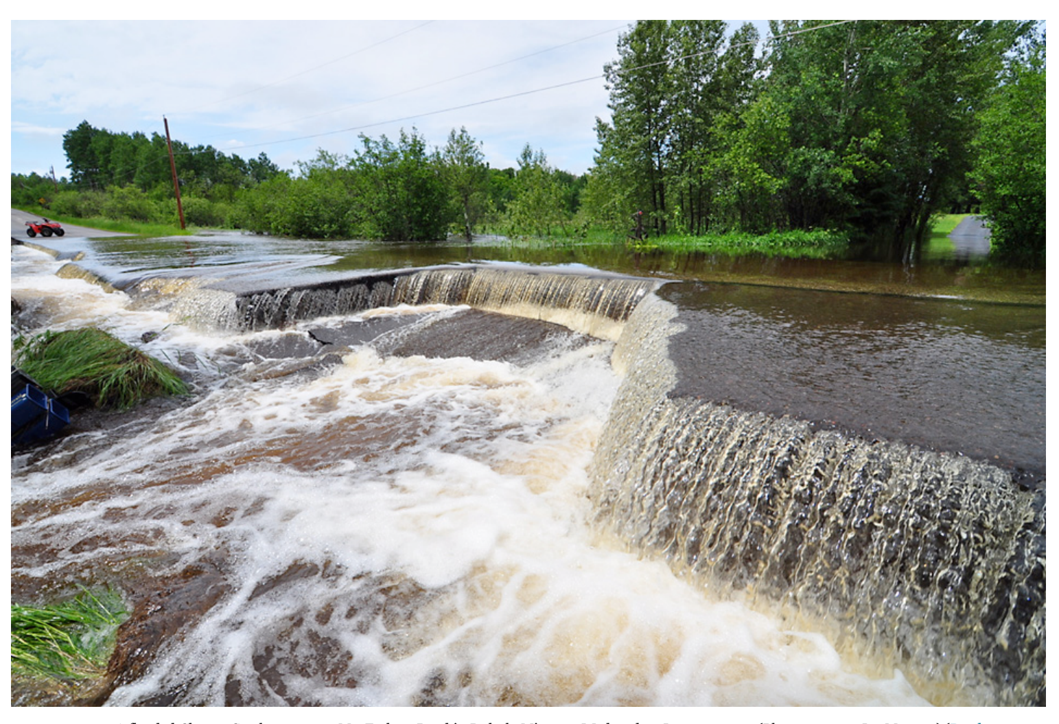
A flooded Chester Creek roars over MacFarlane Road in Duluth, Minn. on Wednesday, June 20, 2012. (Read more about the flood) LINK TO THIS PHOTO