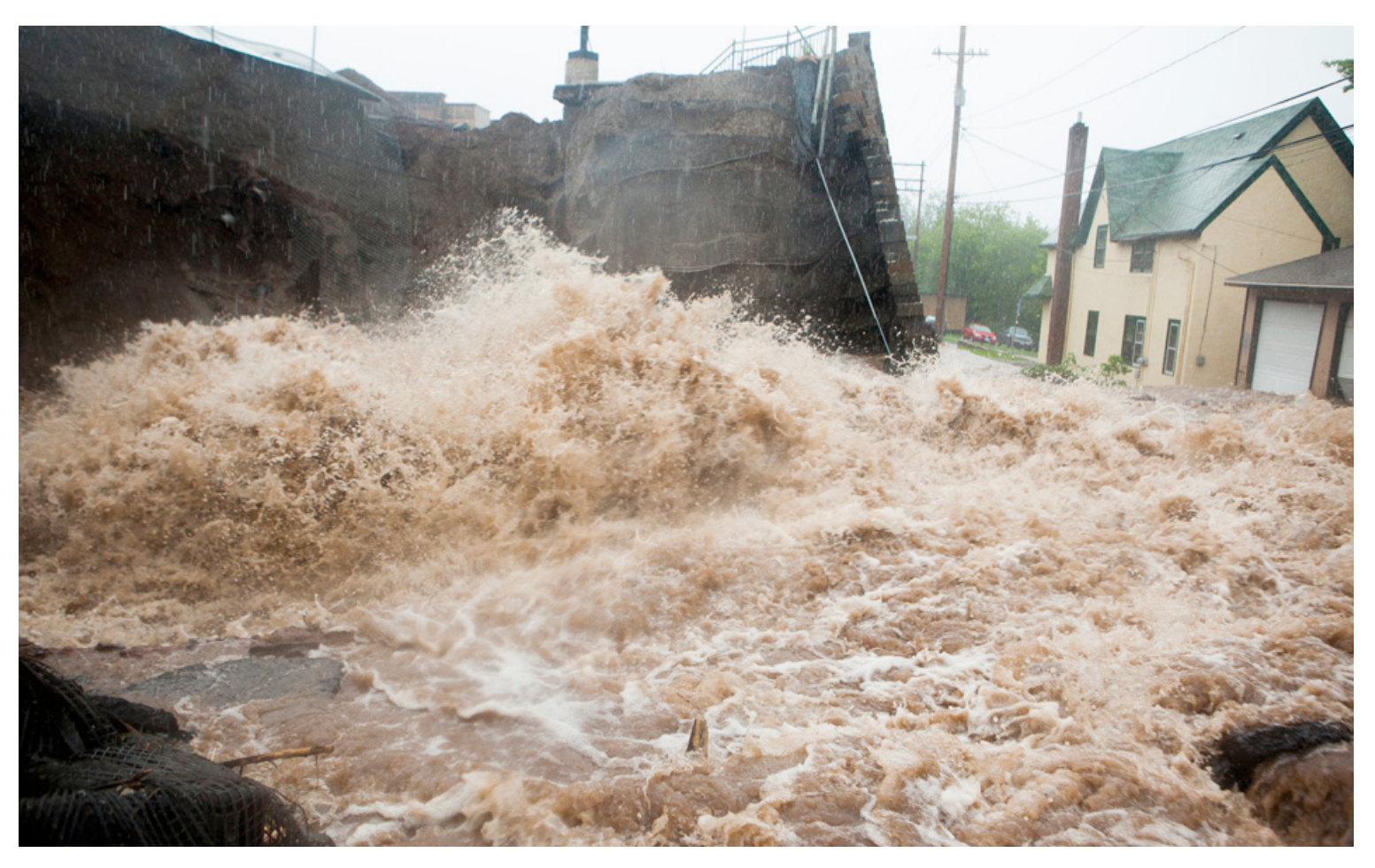
Duluth, Minn. — Brewery Creek burst through a retaining wall adjacent to the Whole Foods coop Wednesday morning after heavy rains caused flooding in Duluth, Minn. (Read more about the flood) LINK TO THIS PHOTO