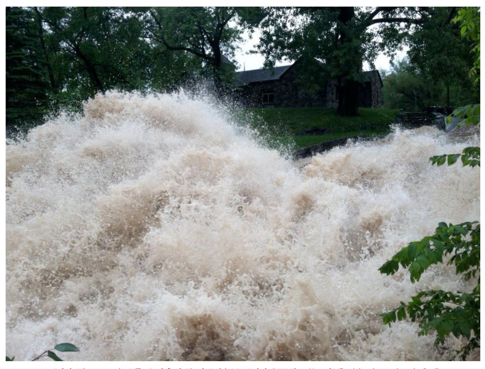
\label{eq:control_problem} \begin{tabular}{ll} Duluth, Minn. - A raging Miller Creek floods Lincoln Park in West Duluth. (Read more about the flood) \\ \begin{tabular}{ll} LINK TO THIS PHOTO \\ \end{tabular}