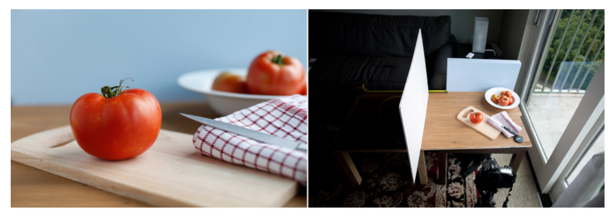
Fill 6 inches away