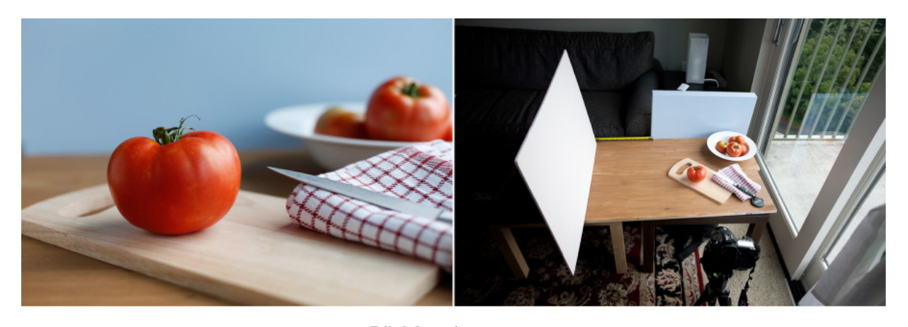
Fill 12 inches away

You can see here that with the foam board 24 inches away there is a decrease in shadow contrast. You can see more detail in the tomato's shadows. Now watch as I move the board closer to the set.