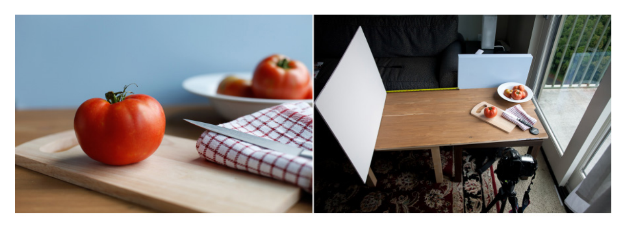
Fill 24 inches away

You can see here that with the foam board 24 inches away there is a decrease in shadow contrast. You can see more detail in the tomato's shadows. Now watch as I move the board closer to the set.