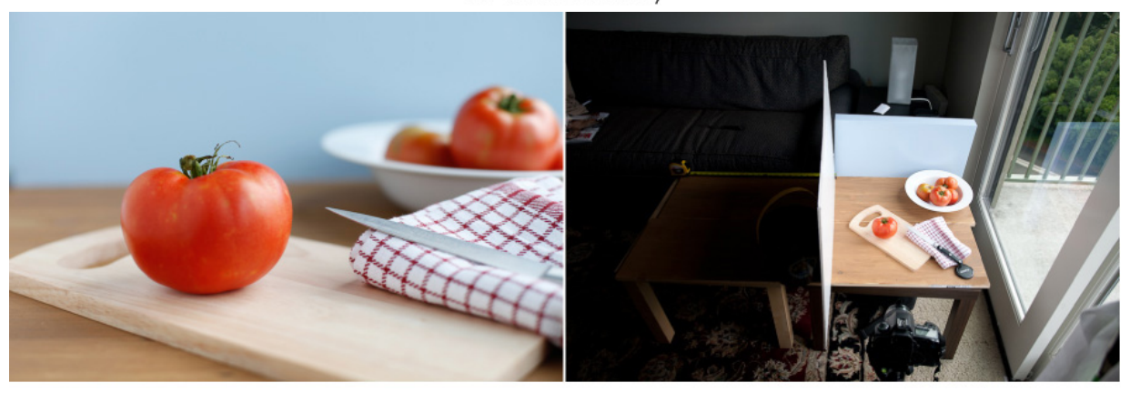
Fill 0 inches away

Now the foam board is as close to the subject as possible. Notice there is still faint shadow present to show the direction of the light. There is no right nor wrong answer to how much contrast you should have. It all depends on what you want your image to say.