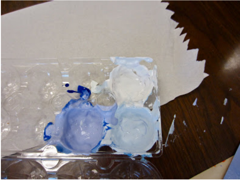
[ http://1.bp.blogspot.com/-mVu1wVhdlkl/TvTBfPGewUI/AAAAAAAAADBs/ArFu3MIgfw0/s1600/IMG_0102.JPG ] First we tri-folded a 9"x12" paper and painted with tints of blue