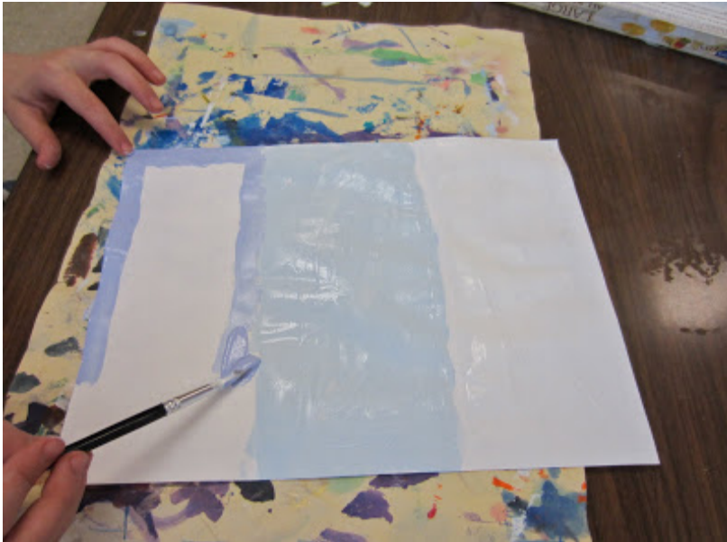
[ http://3.bp.blogspot.com/-UN6x4fuAJXI/TvTBBe8p5ezl/AAAAAAAAADBc/Bn2WkM9va7l/s1600/IMG_0103.jpg ]