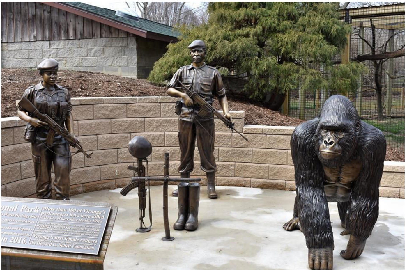
A sculpture depicting conservation efforts at Virunga National Park in the Democratic Republic of the Congo was unveiled at Scovill Zoo.